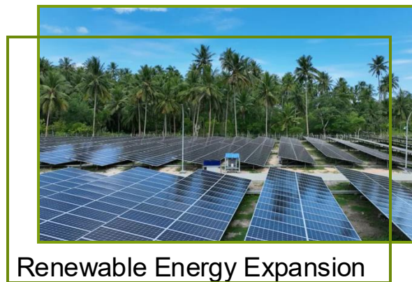
Renewable Energy Expansion