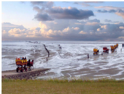
What Hamburg's tiny island can teach cities about resilience