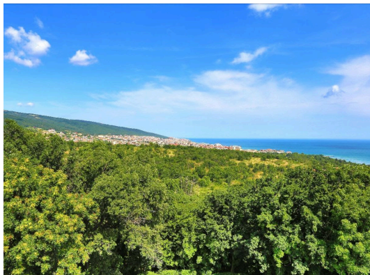
Member in the spotlight: Burgas (Bulgaria)

Athens is reshaping public spaces to fight extreme heat, by planting trees and redesigning squares to create cooler microclimates. Using tools like the Athens Heat Risk Index, the city shows how science, municipal action and citizen engagement can make urban life more resilient to climate change. READ ON >>