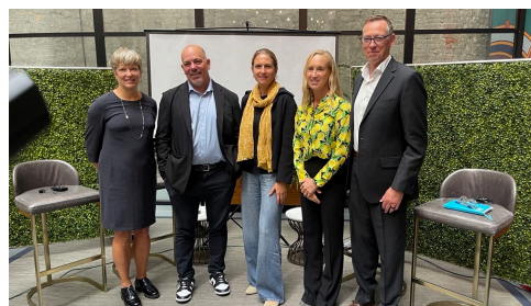
“Power for All: Making Clean Energy Affordable Everywhere” Event