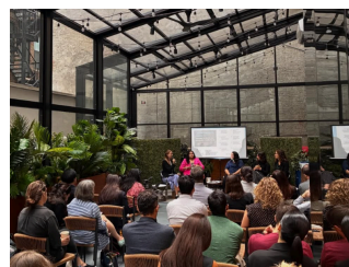
“Secure Energy, Safe Climate: Aligning Policy and Finance to Accelerate the Clean Transition” Event